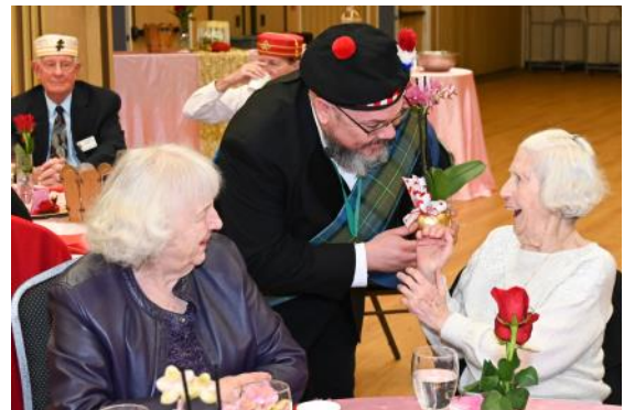
Celebrating our Sweethearts in February

I hope to see you all at our March Stated Meeting,