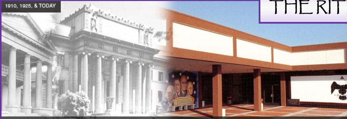
THE ANCIENT AND ACCEPTED SCOTTISH RITE OF FREEMASONRY FOR THE VALLEY OF SAN JOSE IN THE ORIENT OF CALIFORNIA