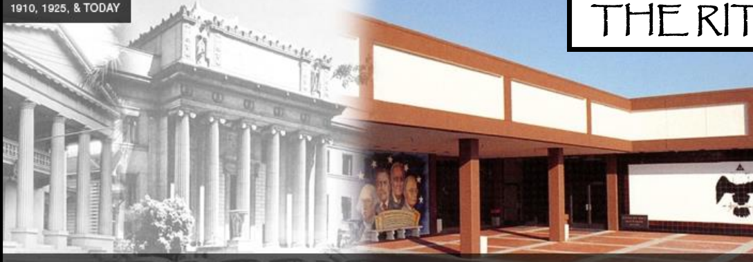
THE ANCIENT AND ACCEPTED SCOTTISH RITE OF FREEMASONRY FOR THE VALLEY OF SAN JOSE IN THE ORIENT OF CALIFORNIA