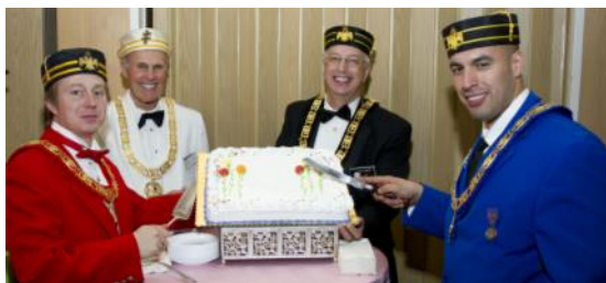
Cutting the ceremonial cake