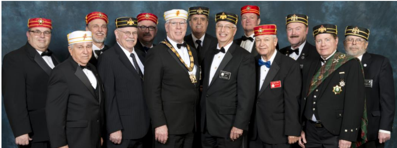
THE GENERAL OFFICERS of the VALLEY of SAN JOSE