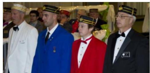
The Installation begins.....