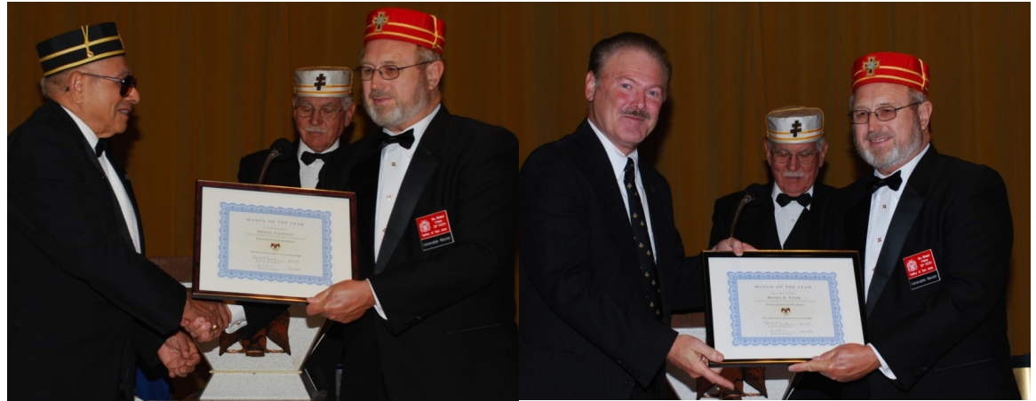
Prestonian Lecturer and two of our Masons of the Year (Check our Website to see more)