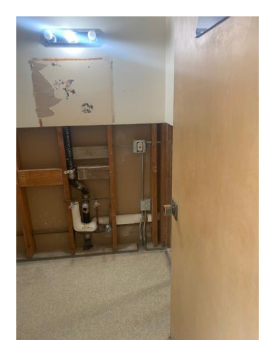
Clinic Bathrooms in Process