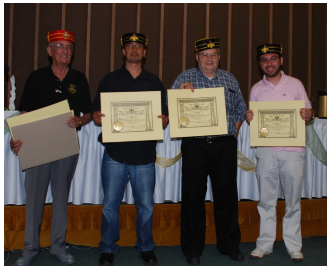
Celebrations at our last stated meeting