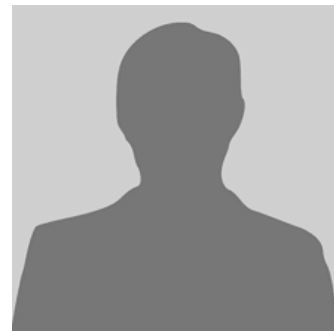
To Be Determined Sovereign Grand Inspector General in California, Ancient & Accepted Scottish Rite Southern Jurisdiction, U.S.A.

The Bodies of the Ancient and Accepted Scottish Rite, sitting in the Valley of San Jose, in the Orient of California, acknowledge and yield all allegiance to the Supreme Council (Mother Council of the World) of the Inspectors General, Knights Commander of the House of the Temple of Solomon of the Thirty Third Degree of the Ancient and Accepted Scottish Rite of freemasonry for the Southern Jurisdiction of the United States of America.