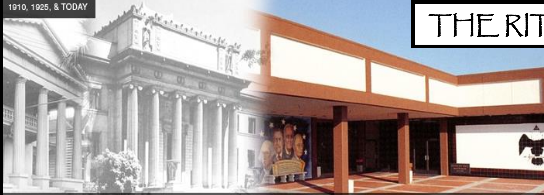
THE ANCIENT AND ACCEPTED SCOTTISH RITE OF FREEMASONRY FOR THE VALLEY OF SAN JOSE IN THE ORIENT OF CALIFORNIA