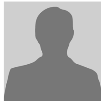
To Be Determined Sovereign Grand Inspector General in California, Ancient & Accepted Scottish Rite Southern Jurisdiction, U.S.A.

The Bodies of the Ancient and Accepted Scottish Rite, sitting in the Valley of San Jose, in the Orient of California, acknowledge and yield all allegiance to the Supreme Council (Mother Council of the World) of the Inspectors General, Knights Commander of the House of the Temple of Solomon of the Thirty Third Degree of the Ancient and Accepted Scottish Rite of freemasonry for the Southern Jurisdiction of the United States of America.