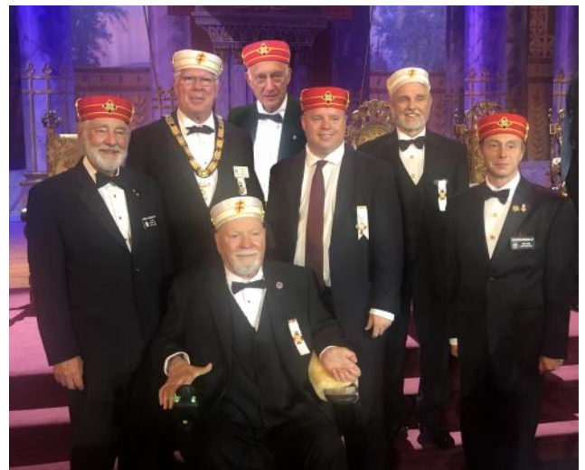
Honormen for 2019

Wear your uniform or proudly display your awards and decorations of achievement. Come out and meet our honored guests.