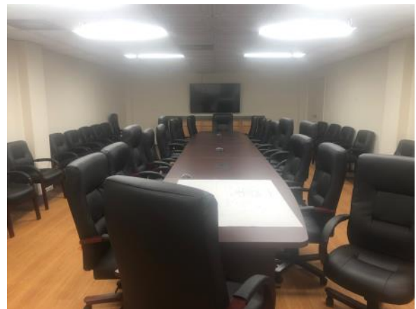
Our New Conference Room