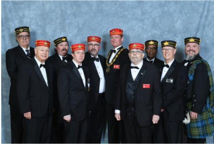
Lodge of Perfection