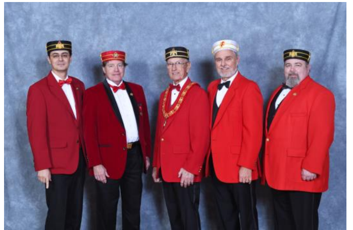
Council of Kadosh