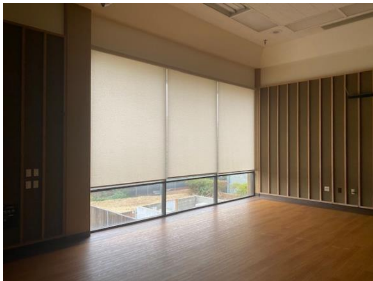
New window coverings in auditorium and dining room and new stage lighting.