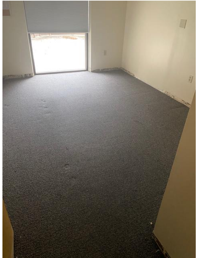
Working on updating the Clinic