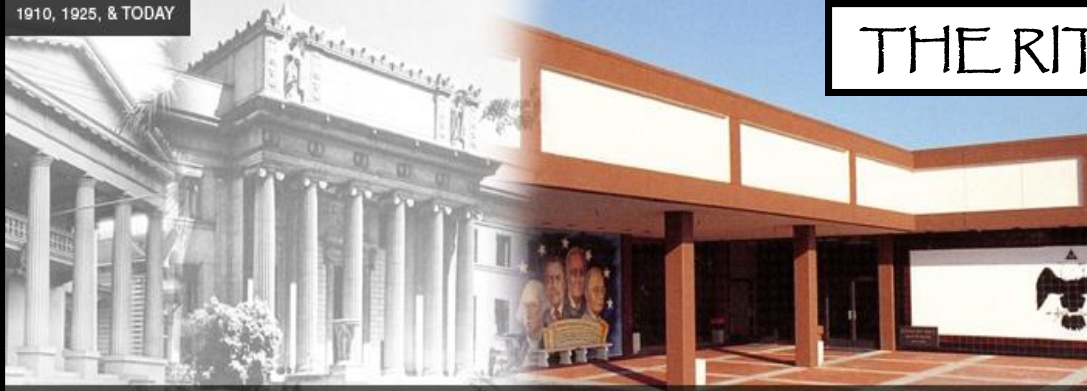
THE ANCIENT AND ACCEPTED SCOTTISH RITE OF FREEMASONRY FOR THE VALLEY OF SAN JOSE IN THE ORIENT OF CALIFORNIA