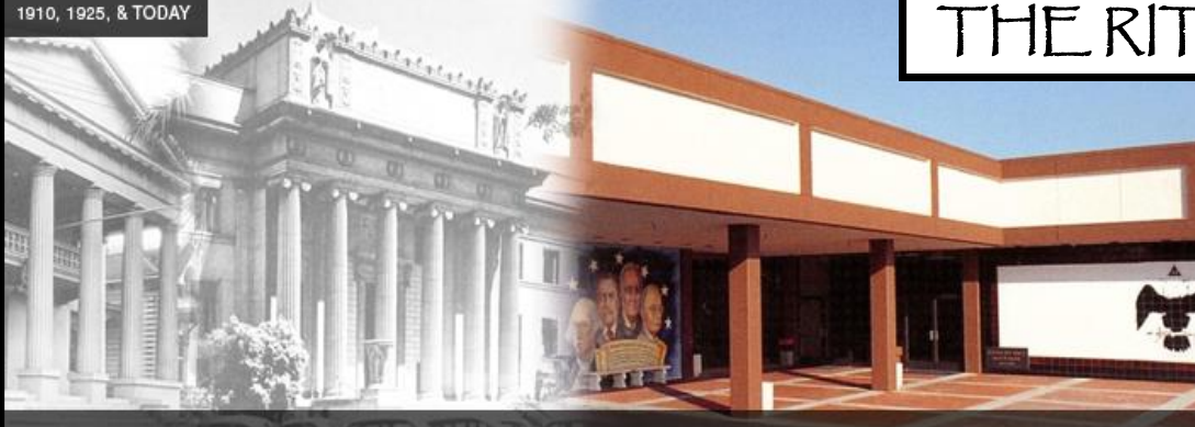
THE ANCIENT AND ACCEPTED SCOTTISH RITE OF FREEMASONRY FOR THE VALLEY OF SAN JOSE IN THE ORIENT OF CALIFORNIA