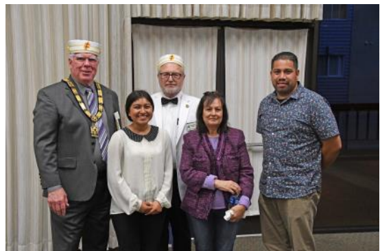
Scholarship winner for 2019