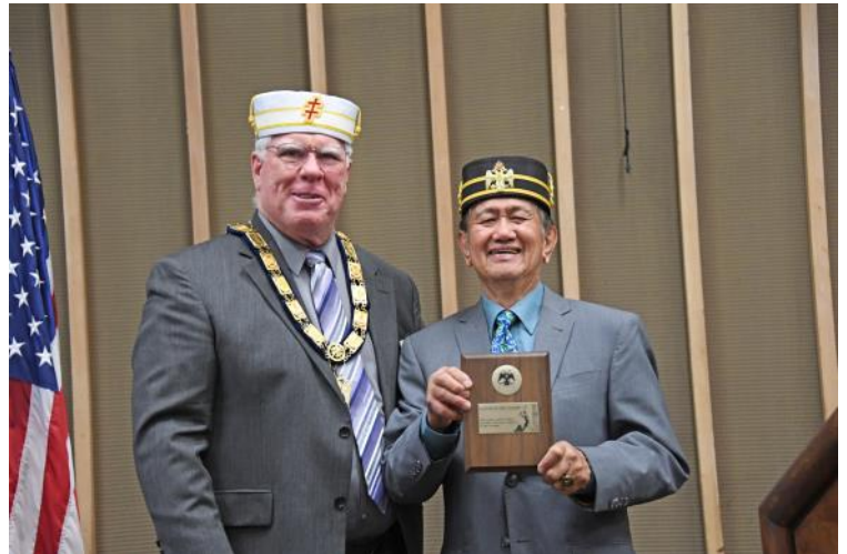
Rebuilding the Temple Plaques