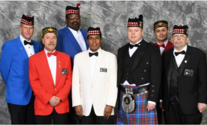
The Knights of St Andrew