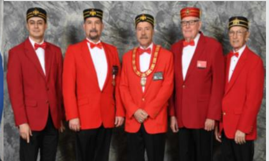
The Chapter of Rose Croix