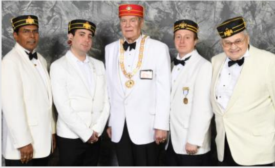
Council of Kadosh