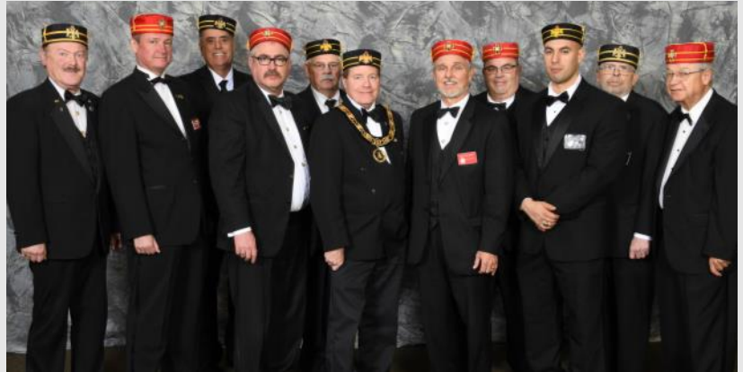
The Lodge of Perfection