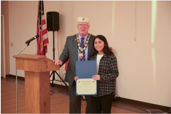
Our 2023 Scholarship recipient