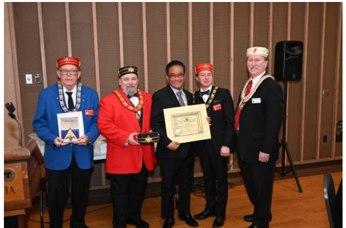
Our Newest Scottish Rite Members