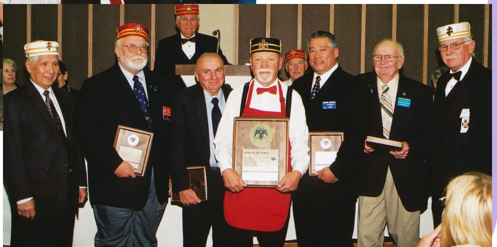
Masons of the year (below)