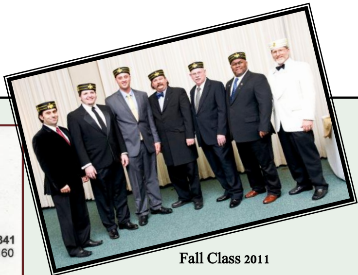
Fall Class 2011